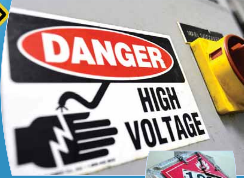
High Risk Pavilion