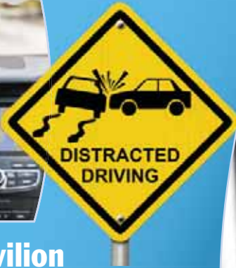
Distracted Driving Pavilion